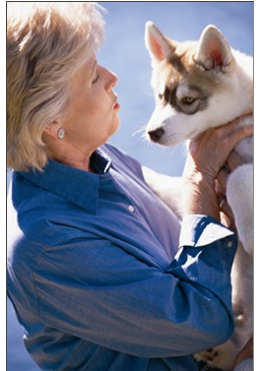
Table or people foods are not usually recommended for pets. Because they are usually very tasty, dogs will often begin to refuse their well-balanced dog food in favor of table food. If you choose to give your puppy table food, be sure that at least ninety percent of its diet is from a quality commercial puppy food. If not, follow a properly formulated recipe that has been developed by a formally trained veterinary nutritionist.

Each of the types of food has advantages and disadvantages. Dry food is definitely the most inexpensive. It can be left in the dog's bowl without spoilage for longer periods of time than canned or moist foods. Semi-moist foods may be acceptable, depending on their quality. The texture may be more appealing to some dogs, and they often have a stronger odor and flavor. However, semi-moist foods are often high in sugar and calories and should be carefully chosen based on their nutritional qualities rather than taste, packaging or consistency. Canned foods are a good choice to feed your dog, but are considerably more expensive than either of the other forms of food. Canned foods contain a high percentage of water, and their texture, odor, and taste are very appealing. However, canned food will dry out or spoil if left out for prolonged periods of time. Canned food is generally more suitable for meal feeding rather than free choice feeding.